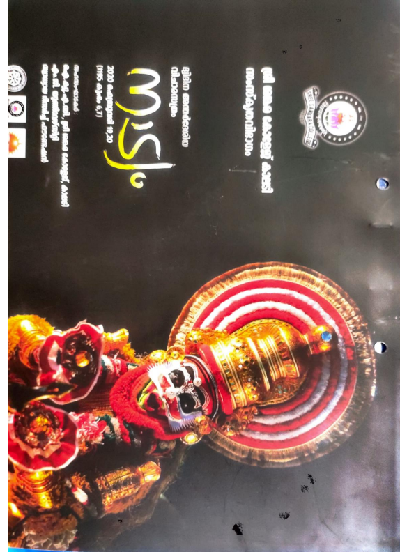
Brochure of the Programme